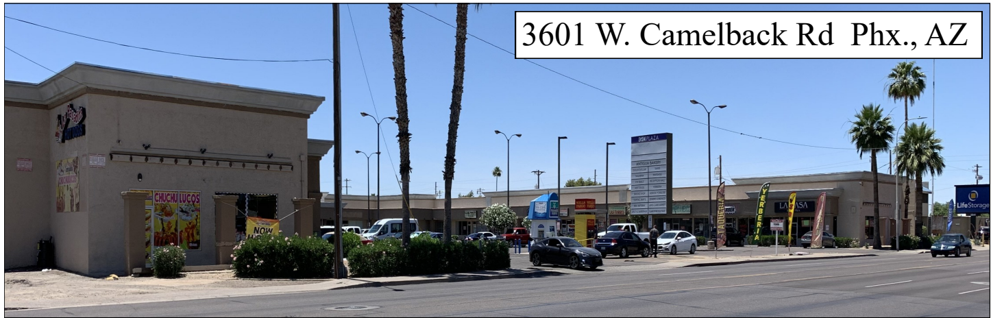
3601 W. Camelback Rd Phx., AZ